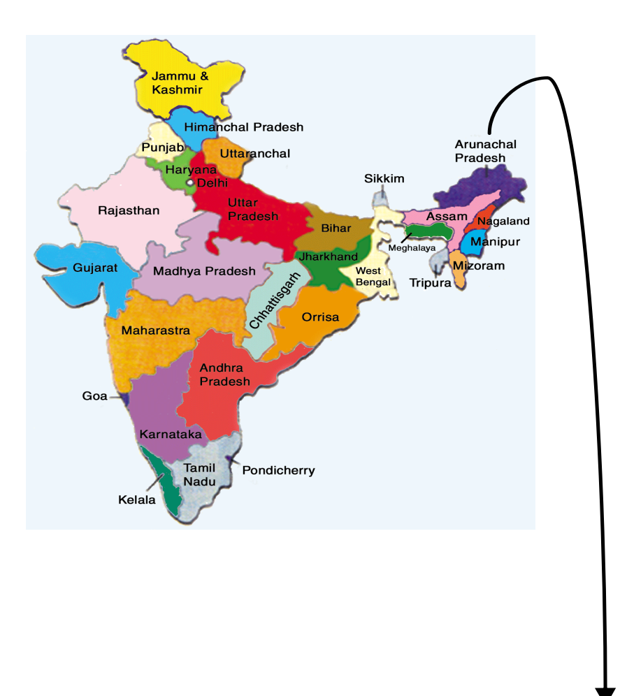
Map 1. Political map of India showing Arunachal Pradesh.