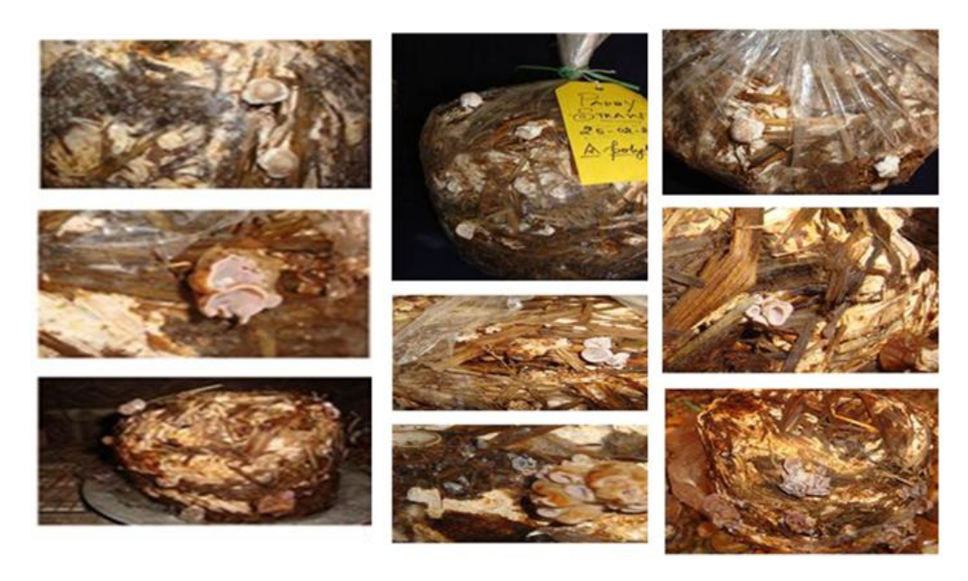
Figure 2. Cultivation of A. polytricha on different substrates.