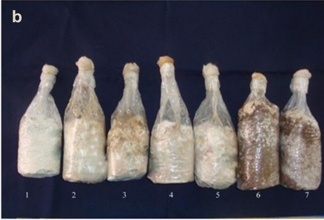
Figure 1. (a) Different growth stages of Auricularia polyticha . 1. Development; 2. Primordial initiation; 3. Fruiting body development; 4. Maturation. (b) Selection of suitable substrate for spawn production. 1. Sorghum grain; 2. Sorghum grain + wheat bran (3:1); 3. Sorghum grain + wheat bran (1:1); 4. Sorghum grain + rice bran (3:1); 5. Sorghum grain + rice bran (1:1); 6. Sorghum grain + saw dust (3:1); 7. Sorghum grain + saw dust (1:1).

optimum for primordial initiation, while fruiting body development was the best at 22±2°C (Table 3).