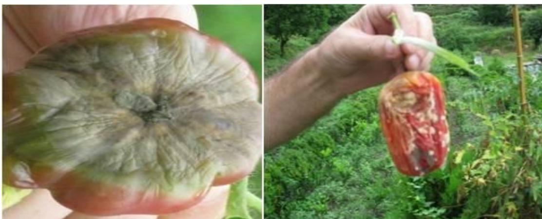
Figure 6. Fruit rot caused by Fusarium sp. nov.

found that the fungus has a wide range of specialization. The local macrocarpous cultivars – PINK, etc., appeared to be less resistant to diseases, but the microcarpous cultivars were relatively resistant.