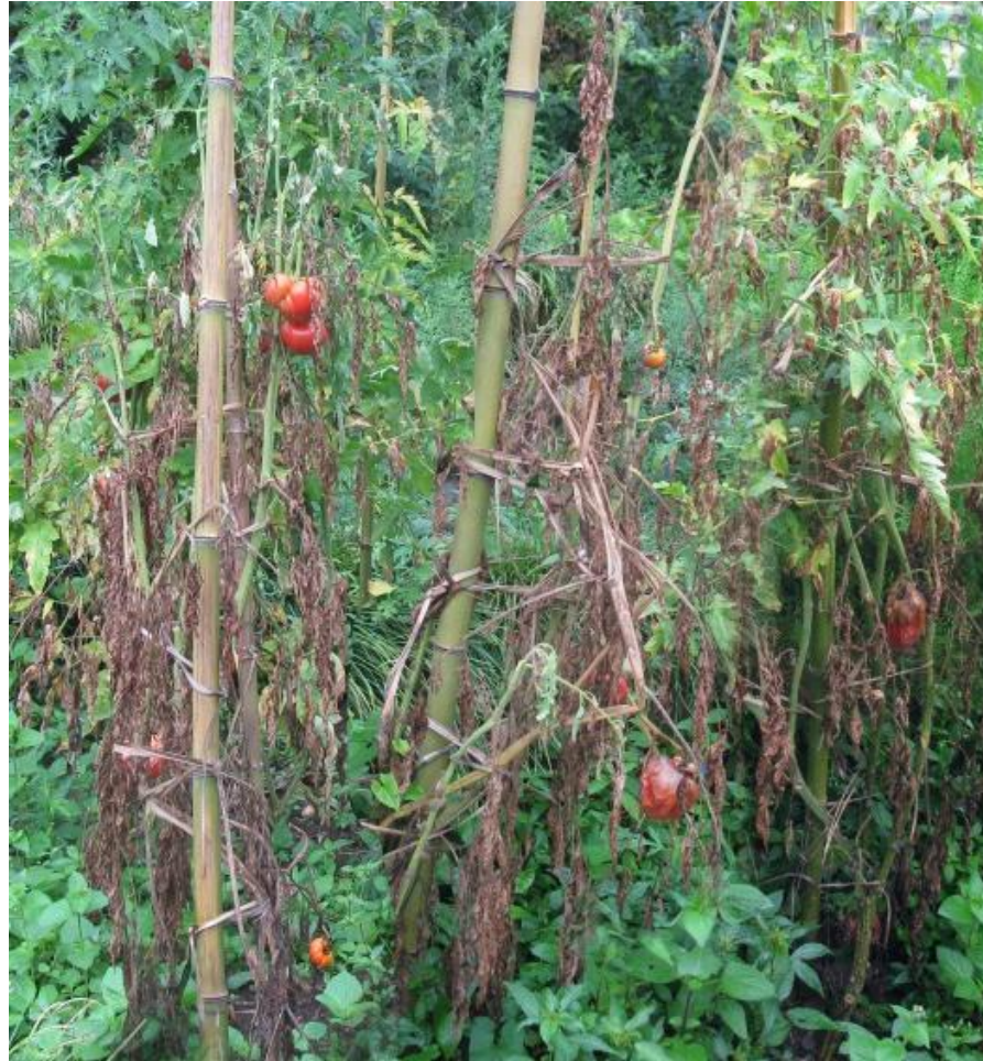
Figure 3. Symptoms of Fusarium wilt on the leaves of tomato plants in open field.