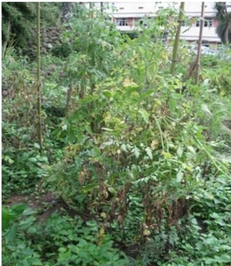
Figure 2. The yellowness of leaves caused by Fusarium sp. nov.