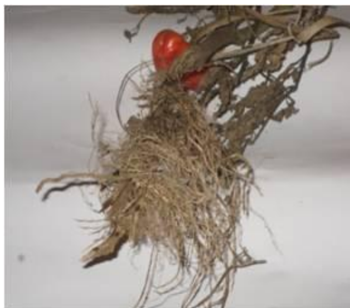
Figure 4. Root rot caused by Fusarium sp. nov.