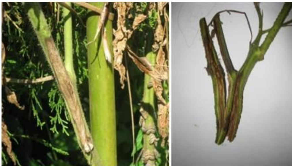
Figure 5. Browning of the vascular system on stem.